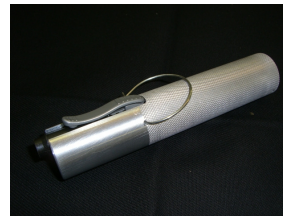
Biomedical Senior Design