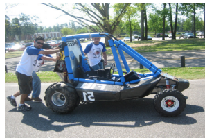
Mini Baja Team at Auburn University MME Senior design